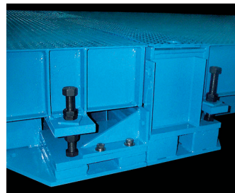
Installs on any stable surface — fast assembly and leveling.

Focus on productivity with same-day setup and operation.