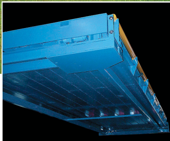
Fully-enclosed sandwich steel construction for greater strength and corrosion protection.