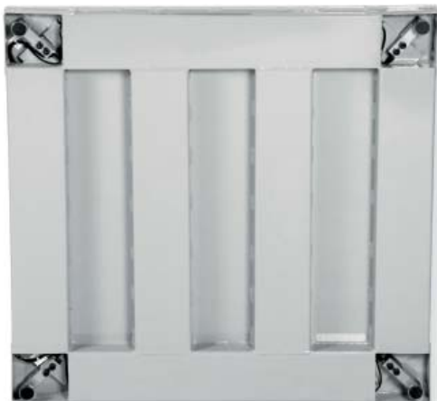
Wide channel design for superior durability